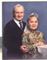
Portrait by Olan Mills, 1993